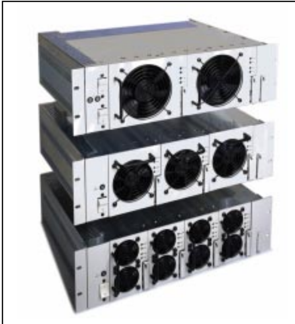
The PS3000 Series Power Shelves are designed to operate with RM-Series rectifiers* in distributed power systems.